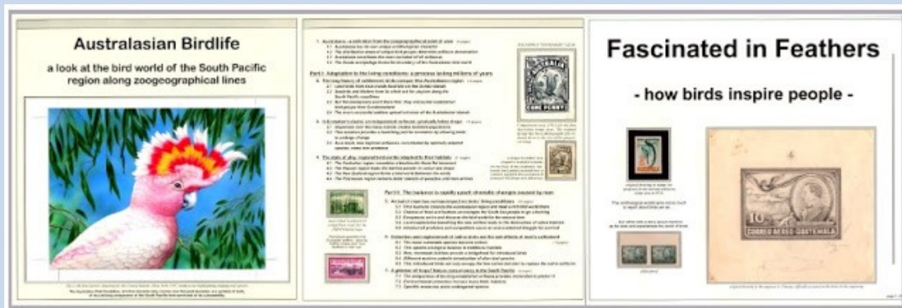
Figure 3. (3 x 4) 12-page (intermediate width between the two mentioned (, 31 x 29 cm)

Finally in the third format (12 sheets per frame), the best known exhibitor is Damian Läge, who innovated with this size in his exhibit on Australasian birds. Exhibit pages in Figure 3 are by Damian Läge.