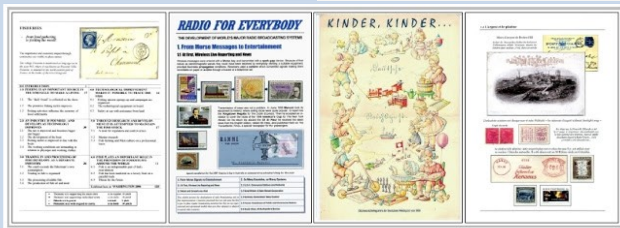
Figure 1. (4 x 4) 16-page by exhibition formats (type A4 or 23 x 29 cm)

EXPOAFE 2015 - QUITO, ECUADOR September 29 - October 2, 2015 Canadian Commissioner EXPOAFE 2015 Jim Taylor [ miquelon@shaw.ca ] 1-403-238-3698