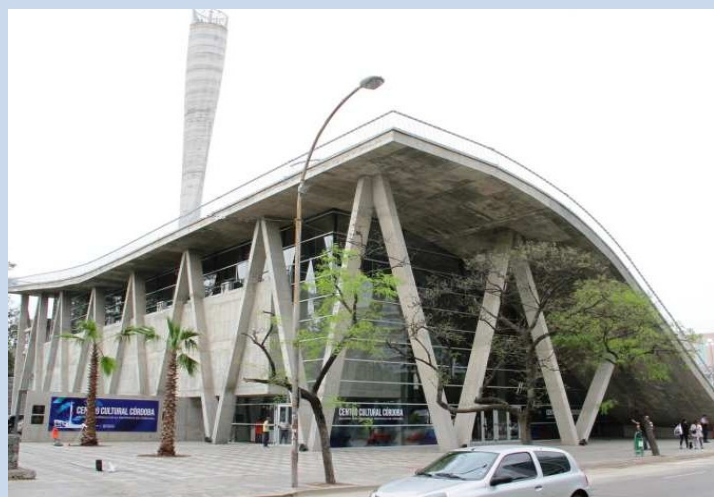
The Cultural Centre in Córdoba, Argentina site of CORDOBA 2016